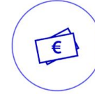
A stronger economy, social justice and jobs