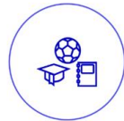
Education, culture, youth and sport