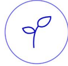
Climate change and the environment

“Other” gathers also all cross-cutting contributions.