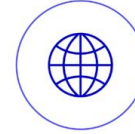
EU in the world