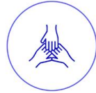
Values and rights, rule of law, security